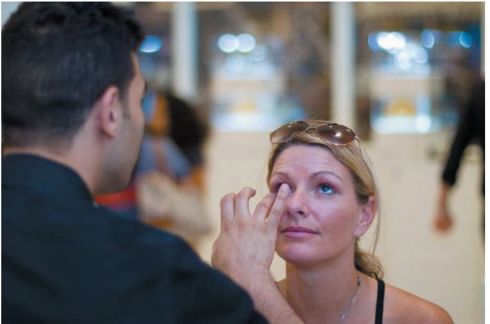
OROGOLD invites the public to enjoy a complimentary skin analysis and demonstration of their products in the store.

When you open the Caviar container, its "look" resembles Caviar